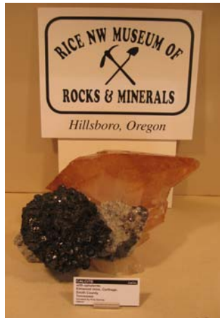
A representative calcite specimen from the Rice Museum that was shown at the Portland show.

The plan is that everyone should bring a bag lunch to eat on the bus before we arrive at the Museum. We will have some drinks available on the bus. We will arrive at the Museum at around 12:30-12:45. The Museum opens at 1:00. Although the bus cost will be paid for by the Club, members will be responsible for their admission fee to the Museum. The fee is $5.00 ($4.50 for seniors). We will leave the Museum at about 4:00. That will give us the recommended time to see the Museum and visit the gift shop. On the way home, we will stop at a restaurant for the evening meal. We should be back in the Tri-Cities around 9:00.